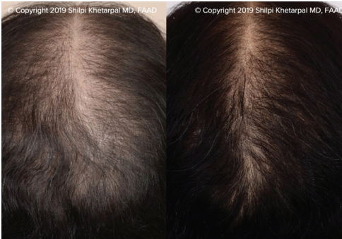
*Before (Left)/After 5 PRP Treatments (Right)