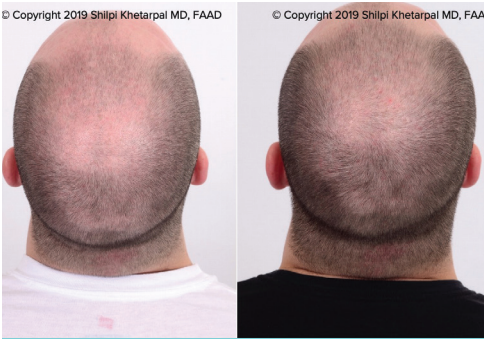
*Before (Left)/After 2 PRP Treatments (Right)