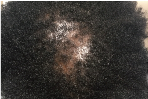
Before PRP Treatments