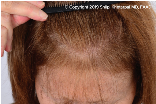
*After 3 PRP Treatments