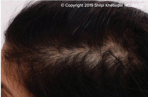
*After 2 PRP Treatments