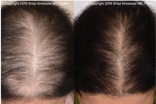
*Before (Left)/After 5 PRP Treatments (Right)