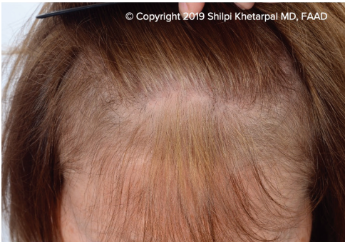
*Before PRP Treatments