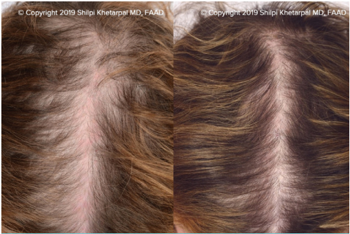
*Before (Left)/After 2 PRP Treatments (Right)